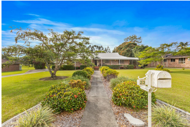
23 Garden Avenue